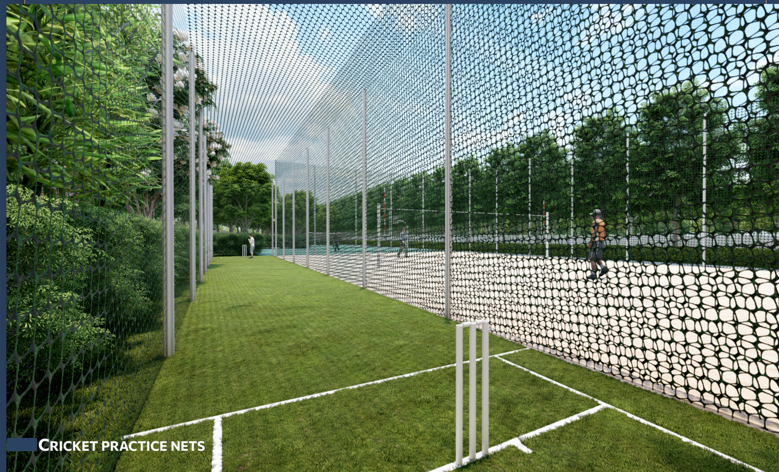
CRICKET PRACTICE NETS