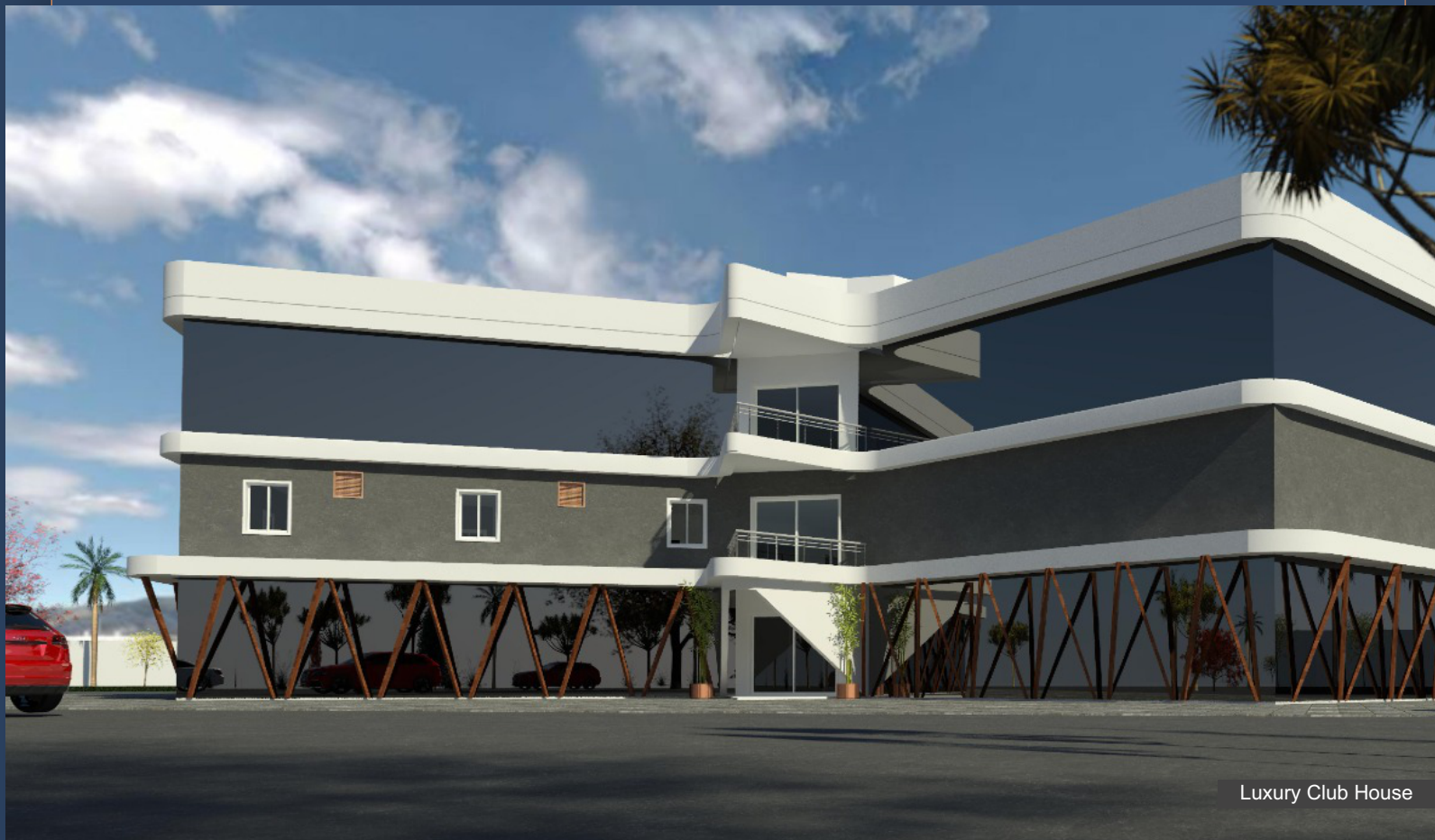
Luxury Club House